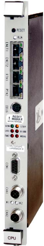
MicroNet Plus CPU5200

The MicroNet Plus system is capable of running in a redundant master / standby configuration to provide higher availability. Synchronized memory assures that both CPUs use the same operating information in every rate group. If the master CPU becomes inoperable, full system control, including control of the I/O, is transferred to the standby CPU in less than 1 ms without affecting prime mover operation. After correcting the master CPU fault, the system can continue running on the standby CPU, or control of the system can be transferred back to the original master CPU. Annunciation of any control transfer is given through communication links.