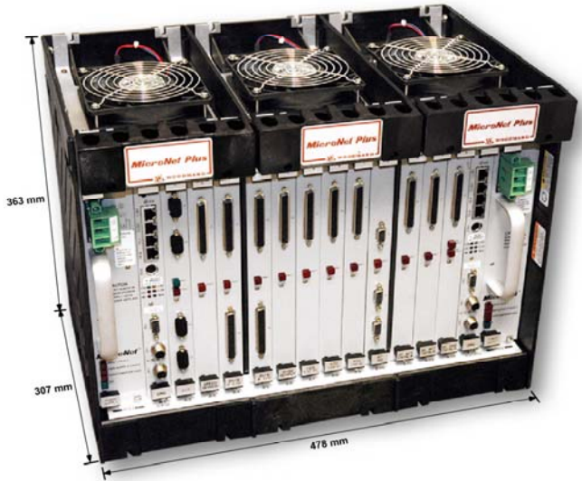
MicroNet Plus Control Chassis (14 VME slot option)