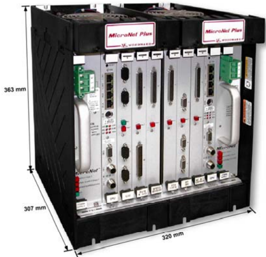
MicroNet Plus Control Chassis (8 VME slot option)

Power supplies may be simplex or redundant in any combination of input voltages.