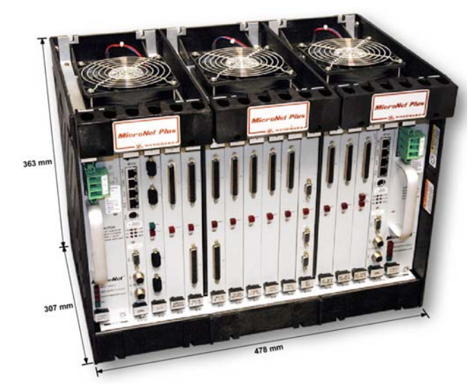
MicroNet Plus Control Chassis (14 VME slot option)