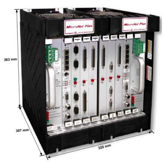
MicroNet Plus Control Chassis (8 VME slot option)

Power supplies may be simplex or redundant in any combination of input voltages.